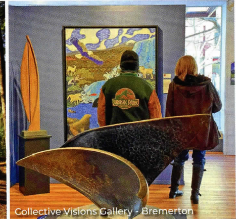
Collective Visions Gallery - Bremerton

Easy to get to by Ferry, Bridge, Boat, or Auto