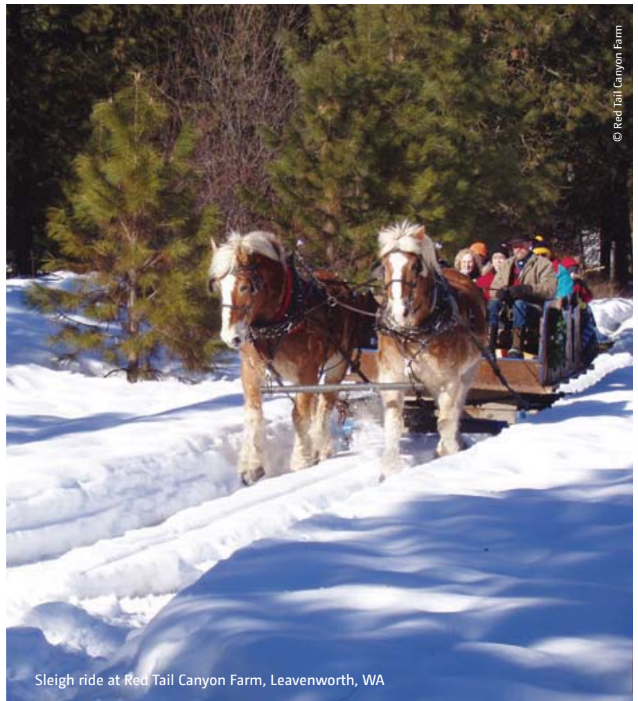
Sleigh ride at Red Tail Canyon Farm, Leavenworth, WA

Each December, Warm Beach Camp becomes a festive Christmas village. Multiple food and beverage