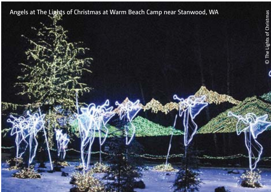
Angels at The Lights of Christmas at Warm Beach Camp near Stanwood, WA