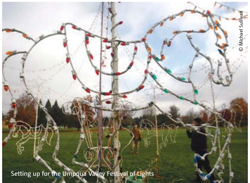
Setting up for the Umpqua Valley Festival of Lights

Operated by the Rotary Club of Roseburg and community volunteers since 1993, the Festival of Lights supports scholarships for graduating high school seniors in Douglas County. Attracting about 30,000 visitors annually, the Festival begins the Sunday prior to Thanksgiving and runs through January 1. For detailed information, go to umpquavalleyfestivaloflights.com . See visitroseburg.com to learn about the community.