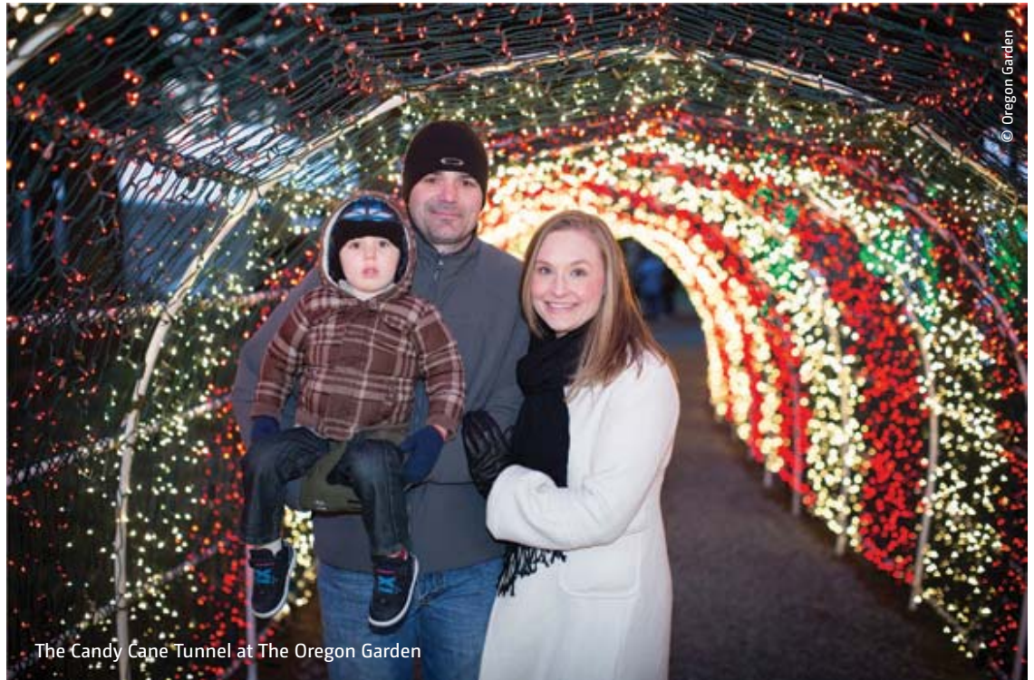
The Candy Cane Tunnel at The Oregon Garden