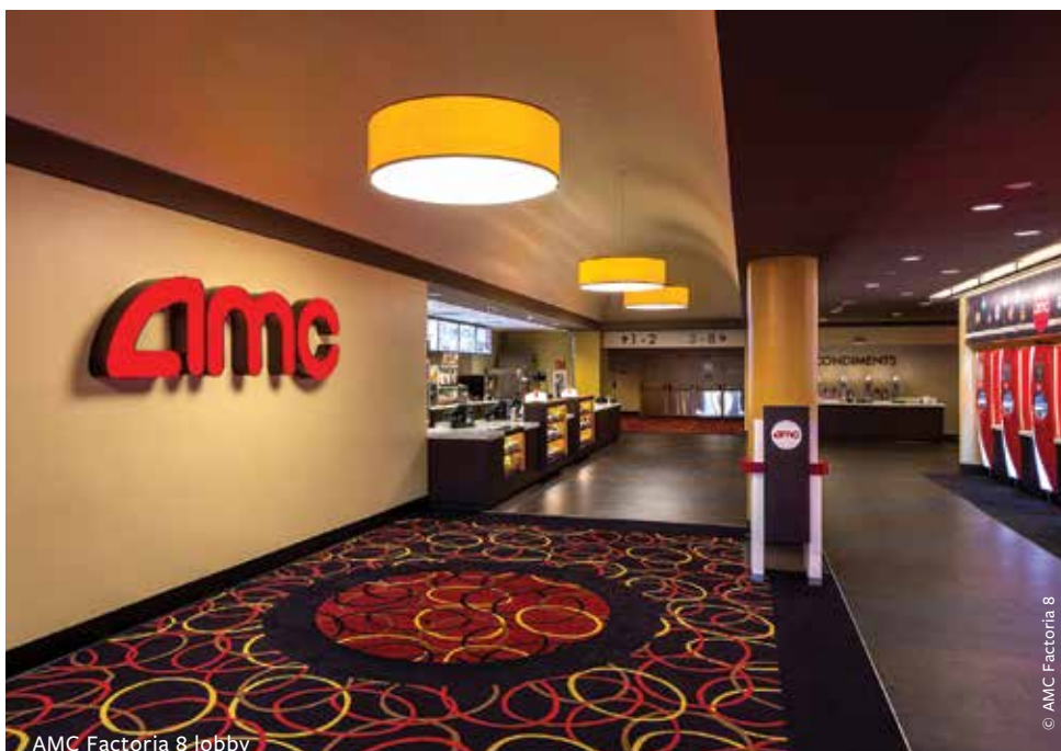
AMC Factoria 8 lobby